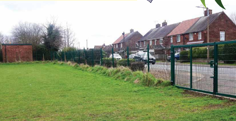
Site of proposed playground, Mansfield Road, Hillstown

We sincerely apologise for the lack of progress but remain hopeful we will soon secure the playground Hillstown families deserve. From now on we will update you regularly on www.scarcliffeparishcouncil.gov.uk