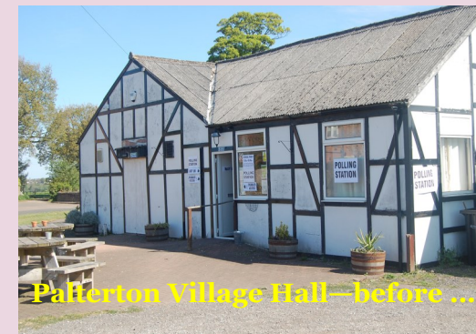
Palterton Village Hall—before ...

The newly-renamed Palterton Village Hall is once again a pleasant venue for community activities and is also used regularly by Palterton Primary School